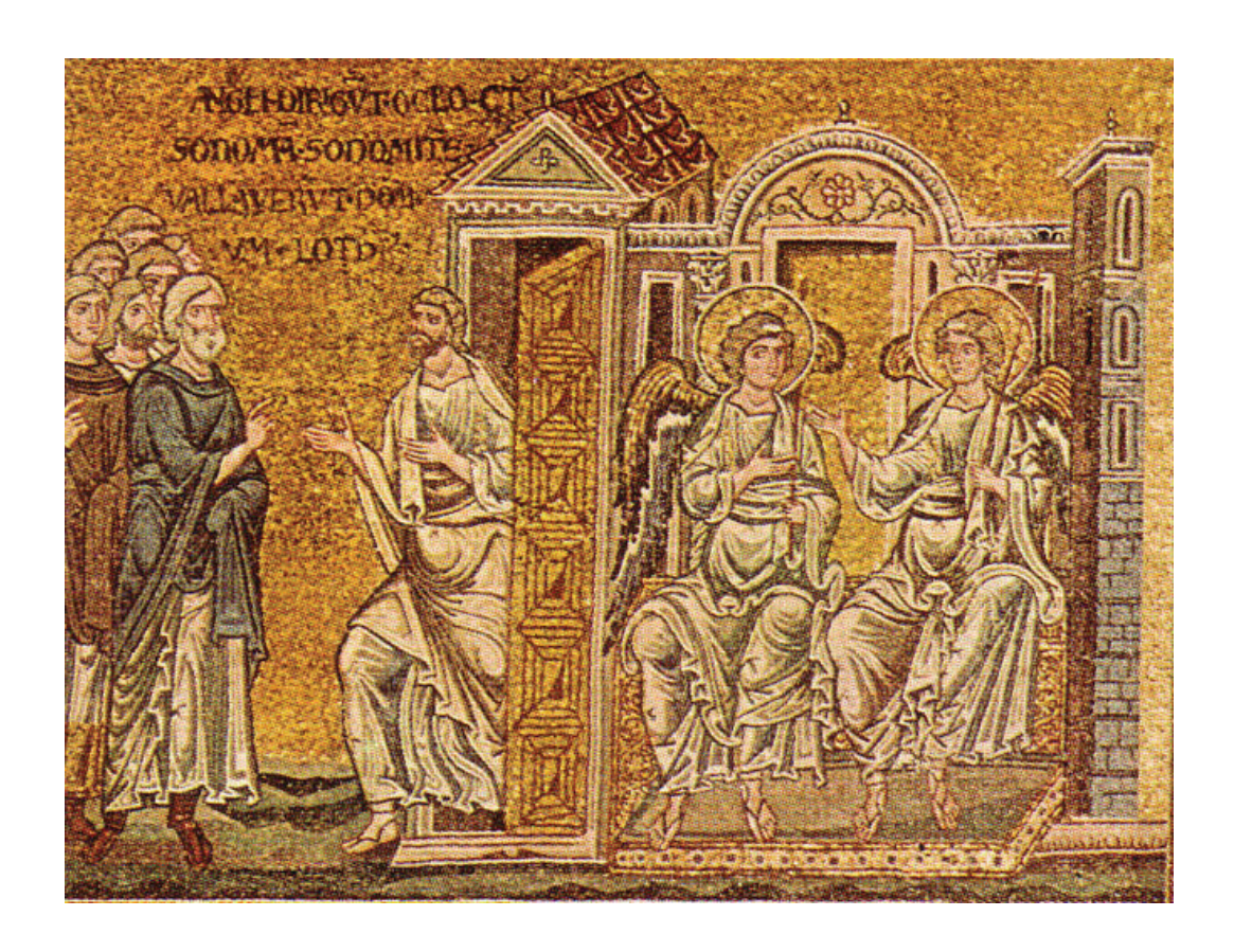
Mosaic in 12th century Cathedral, Monreale, Sicily. On the left, Lot is rebuffing men of Sodom, who wish to "know" (have sex with) the two androgynously attractive angels on the right. The two angels don't look particularly adverse to the Sodomites' proposal.