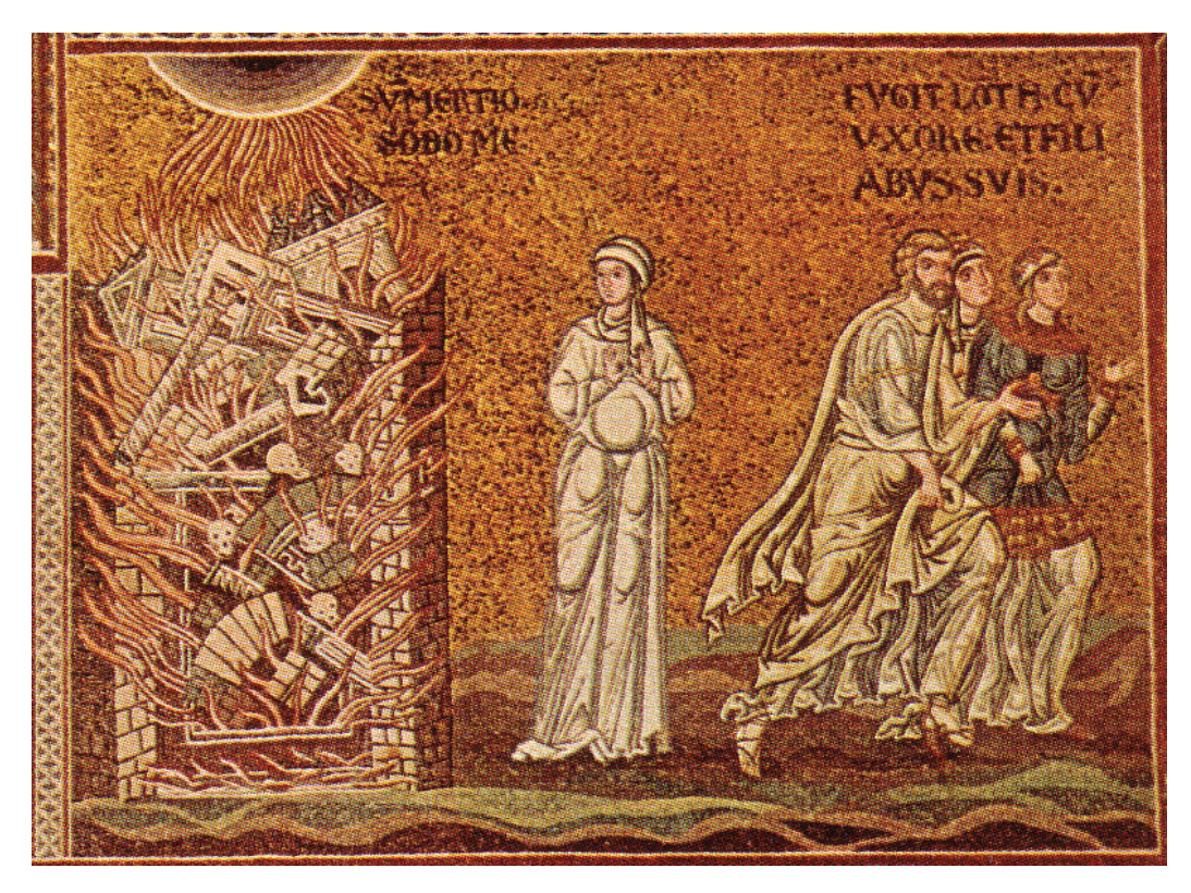
Mosaic in 12th century Cathedral, Monreale, Sicily. On the right, Lot and his daughters are fleeing from the destruction of Sodom. In the center, Lot's wife is about to be turned into a Pillar of Salt for having looked back at Sodom, thus suggesting that she was no prude herself. The phallic symbolism is pretty obvious.