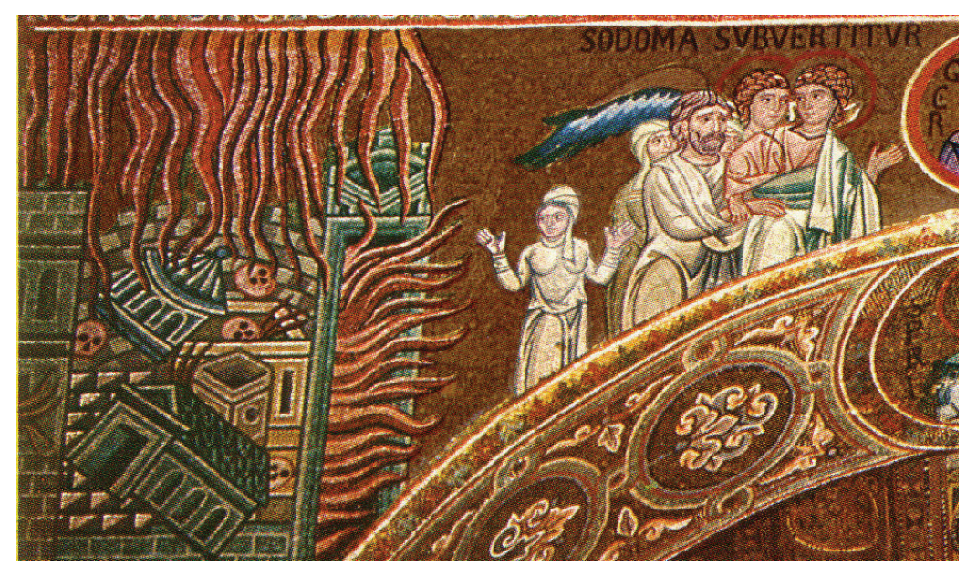
12th century mosaic in the Palatine Chapel, Norman Palace, Palermo. SODOMA SUBVERTITUR — The destruction of Sodom. Lot is fleeing Sodom, accompanied by his daughters, wife, and two angels. The woman in the center, Lot's wife, is about to be turned into a Pillar of Salt for looking back at Sodom. The angel on the right is also looking back, rather wistfully, but angels don't turn into pillars of salt.

12th century mosaic in the Palatine Chapel, Norman Palace, Palermo, Sicily. A fearful and unhappy Lot is rebuffing men of Sodom, who wish to "know" (have sex with) the two angels on the right. The Sodomites look like nice, rather attractive guys. The two angels are all atwitter, wide-eyed in anticipation of a romp with the Sodomites.