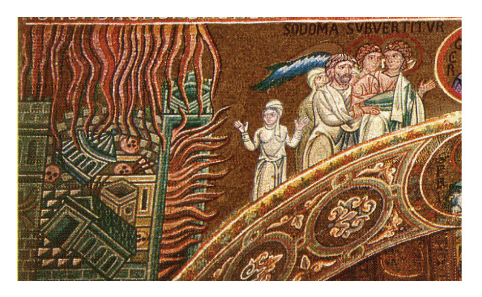
SODOMA SUBVERTITUR — The destruction of Sodom. 12th century mosaic , Palatine Chapel, Norman Palace, Palermo, Sicily.